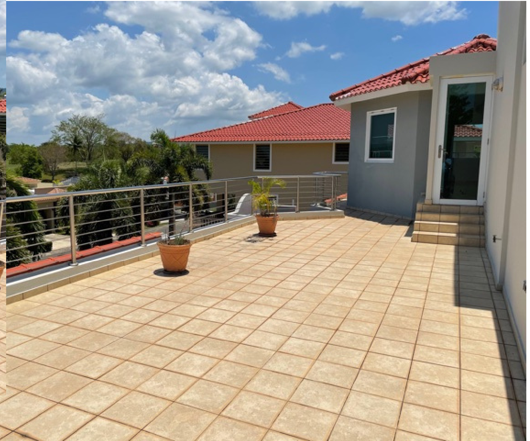
View from the Upper Terrace