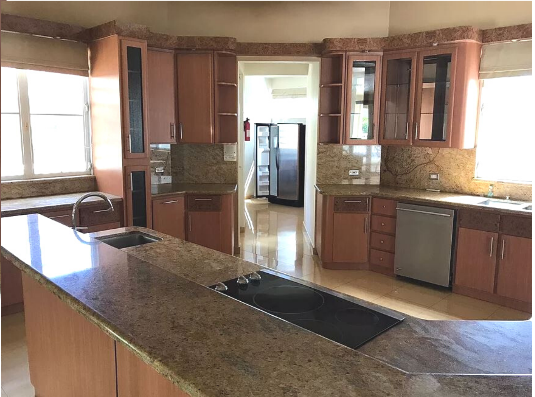
20' x 20' Kitchen Containing Stainless Steel, State-of-the-Art Appliances