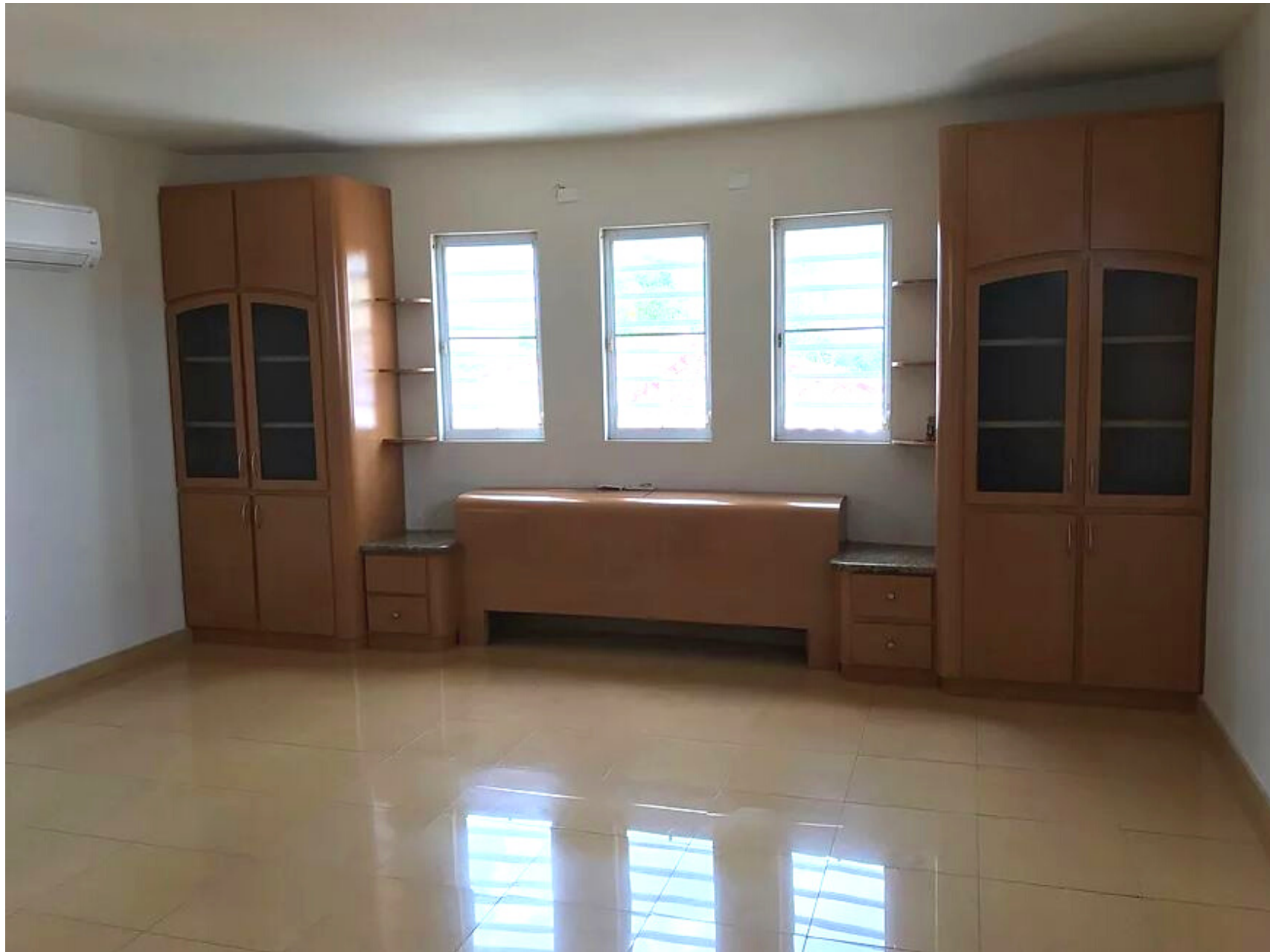
One-of-a-Kind Built-Ins Vaulted Ceilings with Ample Natural Light