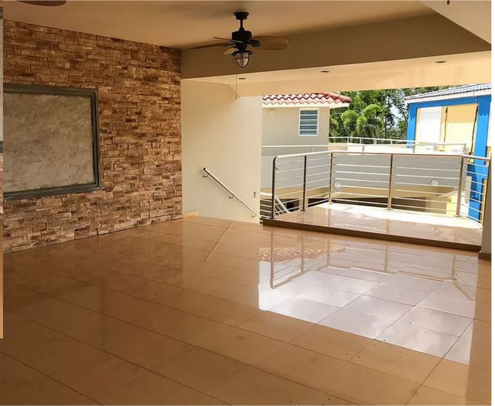
Covered Patio Perfect for Entertaining